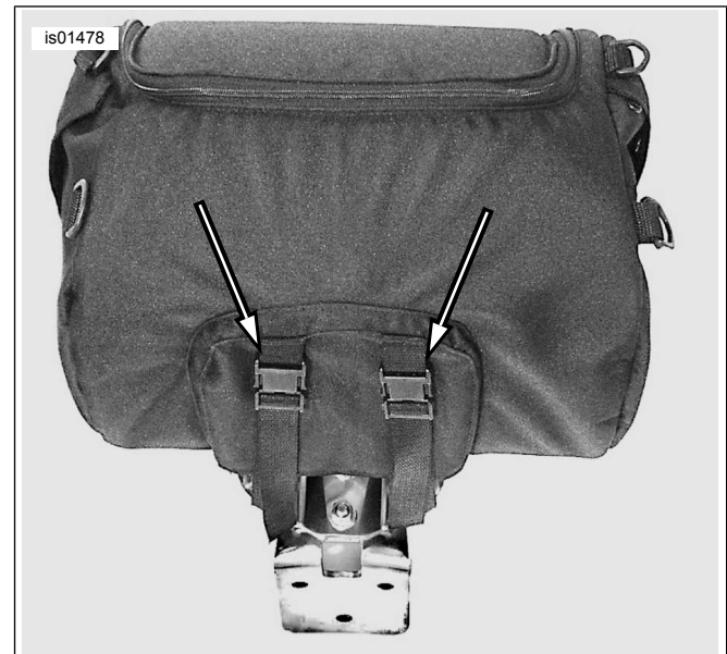
Figure 2. Connect and Tighten the Straps (bottom view)