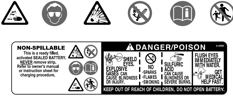
Figure 1. Battery Warning Label