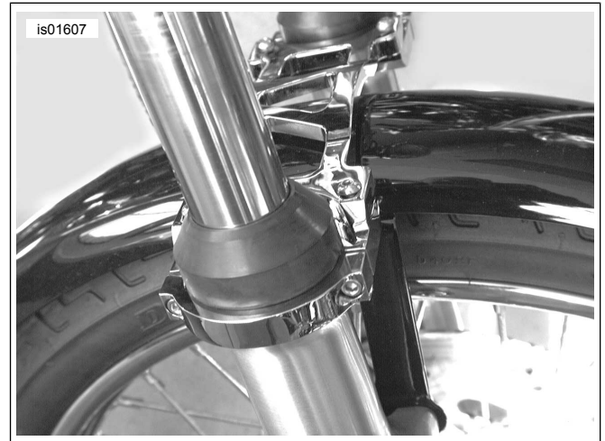
Figure 2. Installing Fork Brace Clamp Halves