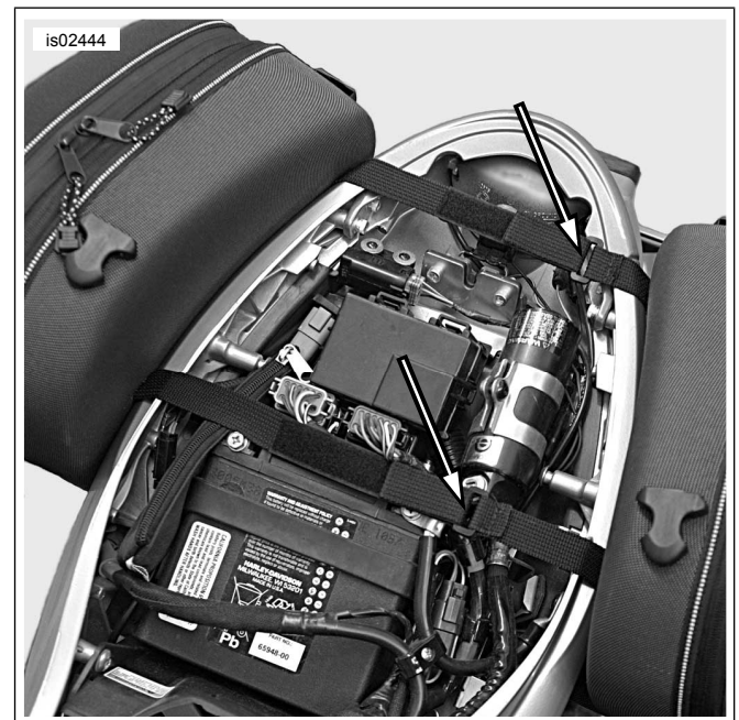
Figure 1. Velcro Straps thorough Buckles