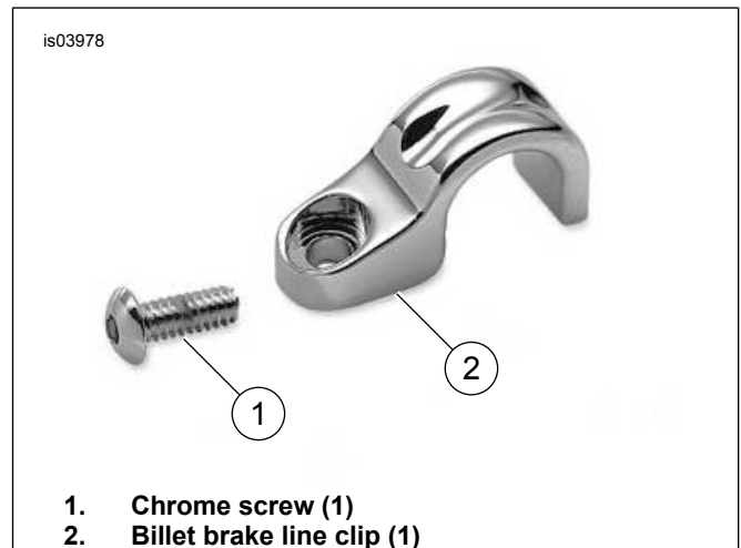
Figure 2. Billet Brake Line Clip and Screw