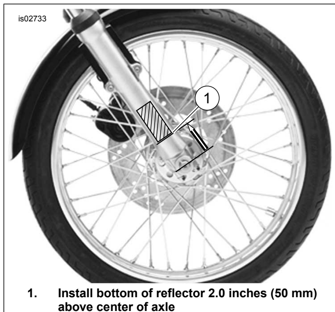
1. Install bottom of reflector 2.0 inches (50 mm) above center of axle