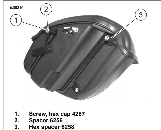
Figure 1. Hardware Substitution When Installing Saddlebag to Sportster with Docking Hardware