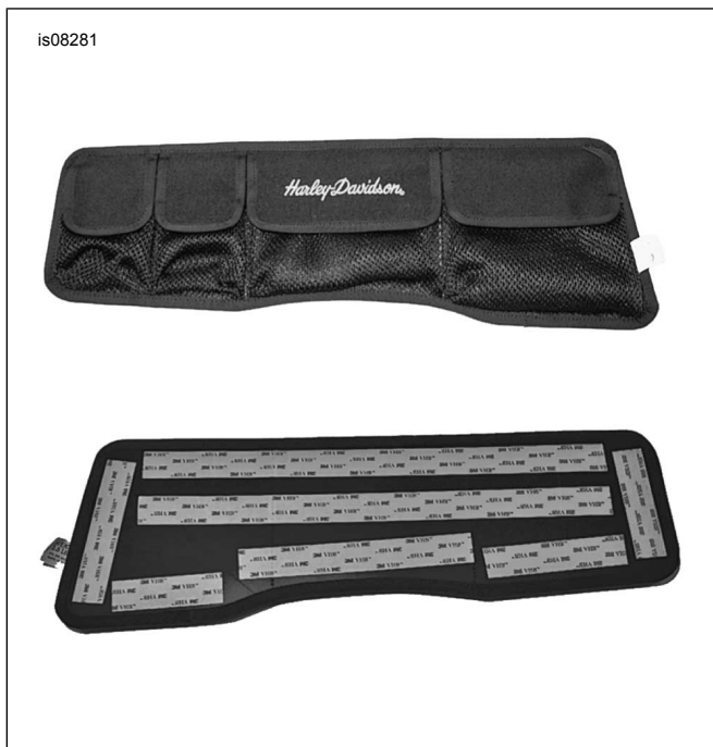
Figure 4. FLHRC Saddlebag Lid Organizer (Front and Back)