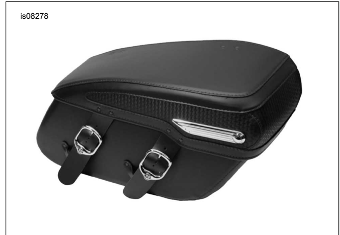
Figure 1. FLHRC Leather Saddlebag (right side shown)

The ideal temperature range for applying the tape is 70°-100° F (21-38° C). Minimum application temperature is 50° F (10° C). If you attempt to apply the tape below these temperatures, the adhesive will become too firm to adhere readily.