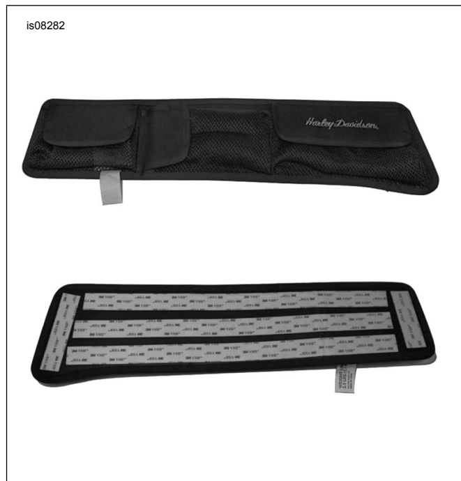
Figure 5. FLHRS Saddlebag Lid Organizer (Front and Back)