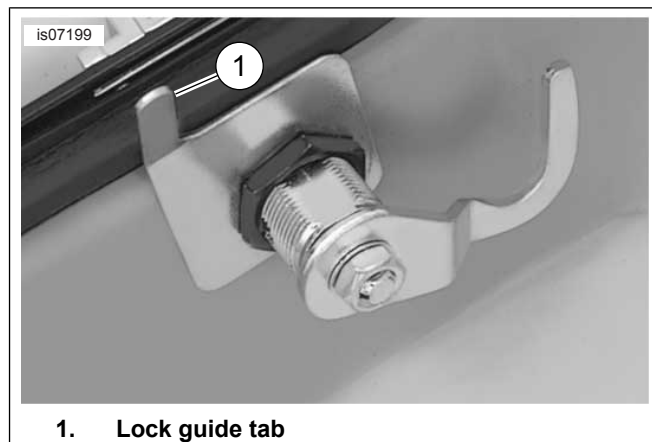
Figure 2. Lock Guide