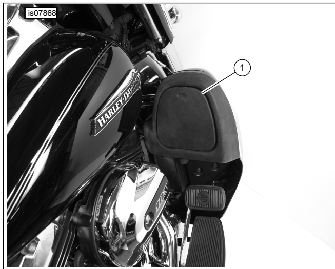
Figure 1. Push top of door to open