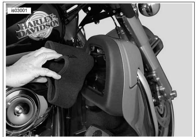
Figure 3. Install Liner into Glove Box (right side shown)