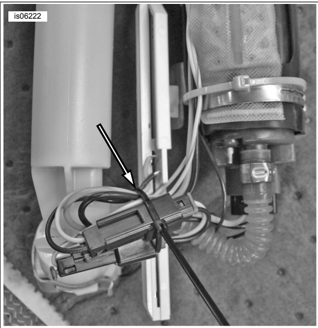
Figure 2. Secure Fuel Pump Wires and Connectors