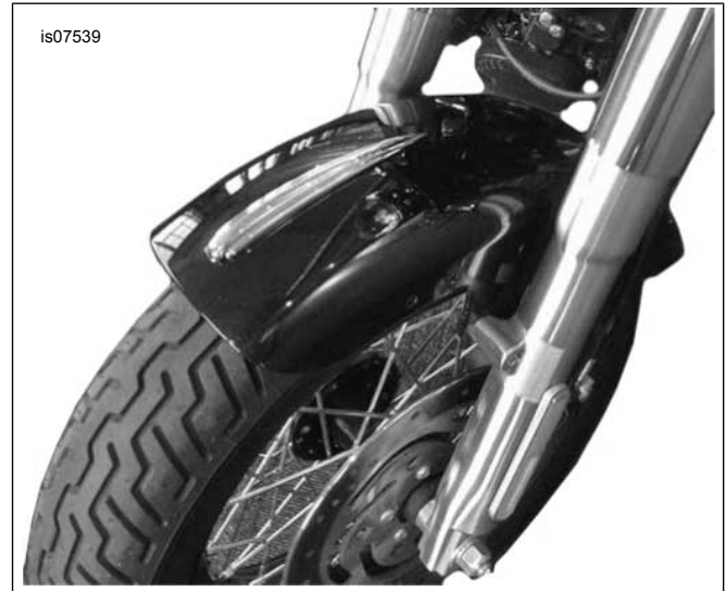
Figure 1. Front Fender Trim Placement - Small Fenders