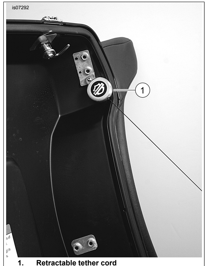
1. Retractable tether cord

Do not overload the Tour-Pak lid rack if equipped or damage can result to the tether and/or Tour-Pak.