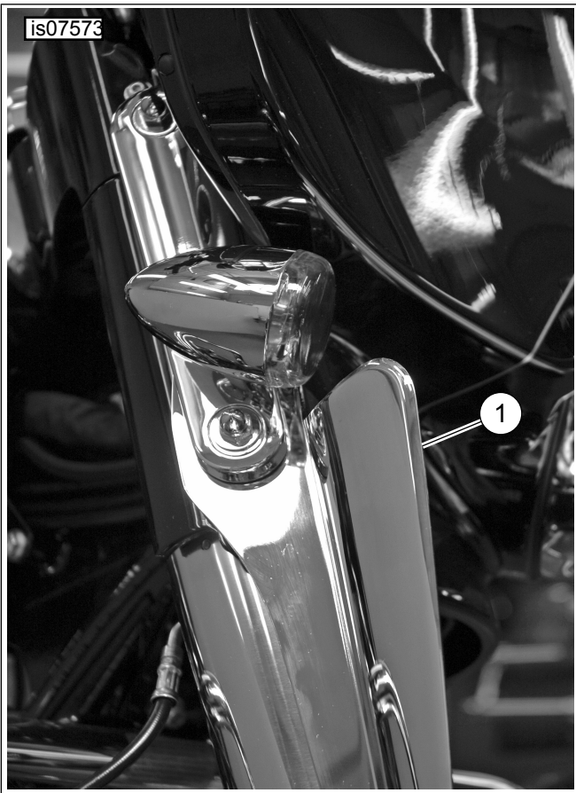
Figure 2. Wind Deflector