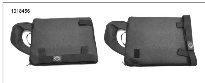
Figure 5. Mounting Strap on Seat