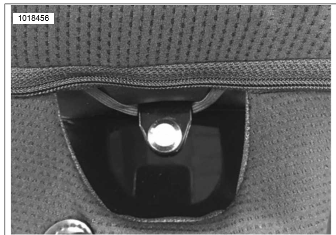
Figure 6. Mounting Tabs, Rider Pad