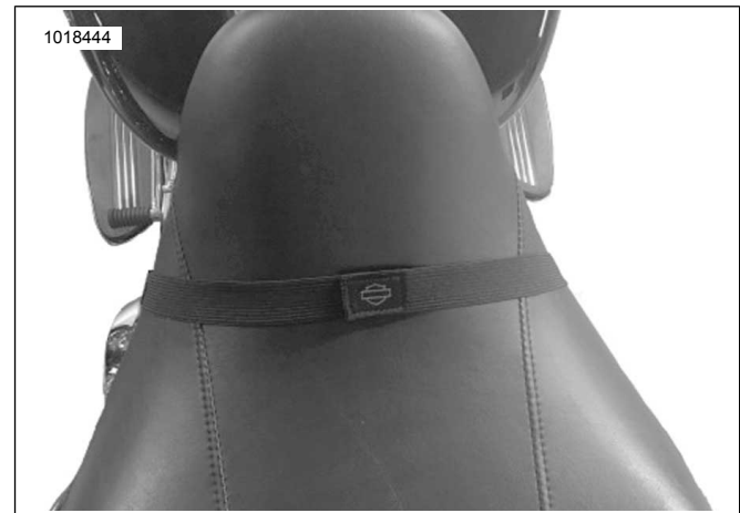
Figure 2. Mounting Strap on Seat