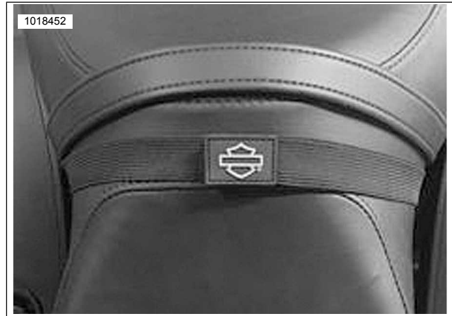
Figure 4. Mounting Strap