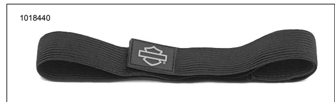
Figure 1. Mounting Strap