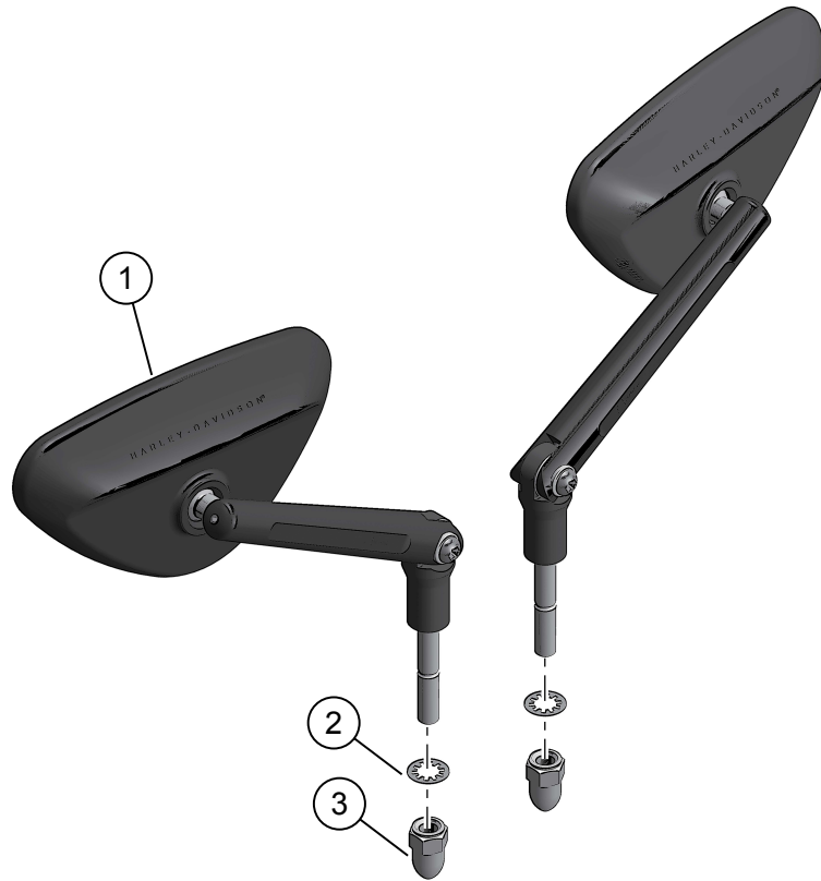
Figure 1. Kit Contents: Mirror Kit Components