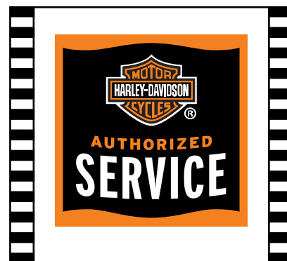
Video 2. Road Glide Audio