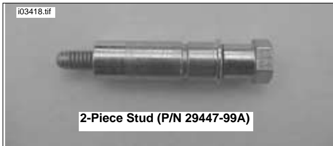
Figure 1. Replace mounting studs if necessary