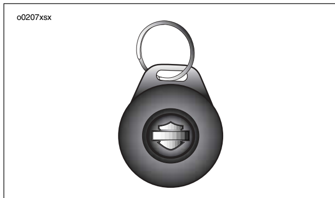
Figure 38. Key Fob

Remote arming/disarming: See Figure 38. Owners may enable and disable security alarm and immobilization functions with a remote, personally carried transmitter. This transmitter is referred to as a key fob within this document.